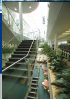
University of Hertfordshire Resources Centre

“There is a clear vision for developing a 14-19 curriculum. Leadership and management are good with a clear vision for development of a 14-19 continuum.” (Ofsted)